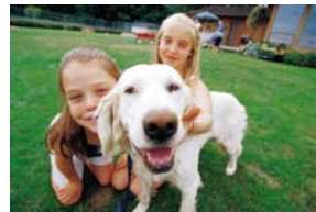
Always remember to include pets in domestic violence safety planning

a domestic violence shelter. However, often, with a little advance planning, a pet can be housed with a friend or family member. The Linkage Project is proud to be involved with this along with the Maine Coalition for Domestic Violence and Maine's Animal Welfare program